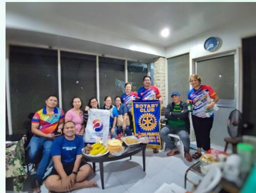
5 th Club Meeting and Fellowship