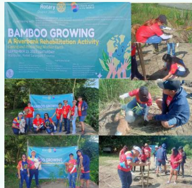
Bamboo Planting Activity