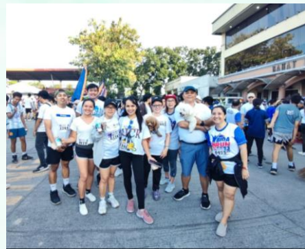
Participating on the BIDA RUN 2023 aiming to spread awareness on War on Drugs

A total of 206 bikers were registered and supported this cause-based activity. Thank you, DOLE Philippines, Inc. for supporting by donating refreshing pineapple juice during the Ride to End Polio.