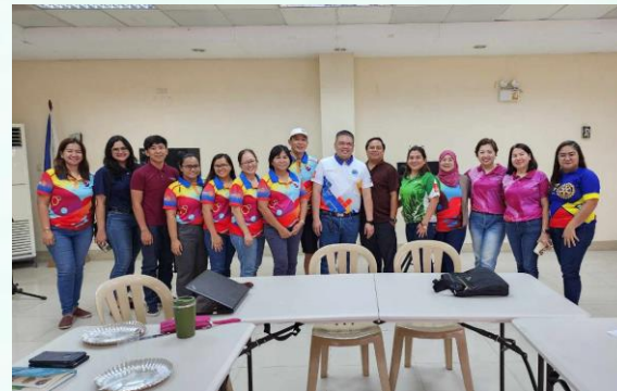
3rd ACOM sponsored by RC Central Polomolok where Bamboo Planting was the main discussion point.