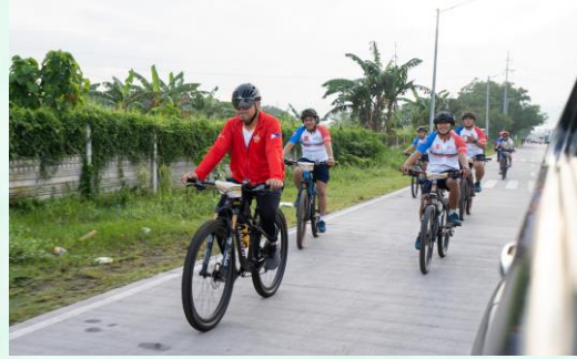
Sept 10: Bike to End Polio 1 st Leg Gensan

A total of 206 bikers were registered and supported this cause-based activity. Thank you, DOLE Philippines, Inc. for supporting by donating refreshing pineapple juice during the Ride to End Polio.